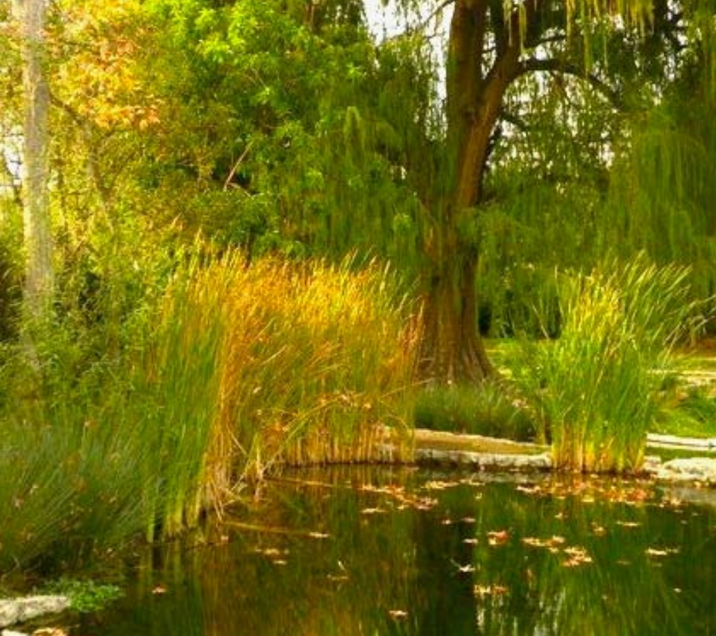
Left, The springs are a tranquil oasis in West L.A.

efforts and dedication, the springs still bubble today, creating pools and small streams amid the lush foliage of the sacred grounds. But even today the continued flow of the springs is always threatened every time there is new construction uphill along Wilshire Blvd. Deep foundations can mean changes to the sub-strata water table. And because of concerns about underground pollution, the springs are no longer used as a water supply, channeled instead into the municipal drainage system and out to sea.