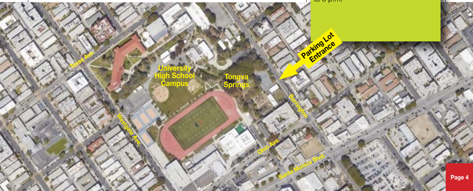
Below, How to find the Tongva Springs: The entrance to the parking lot is on the west side of Barrington between Texas Ave. and Ohio Ave.