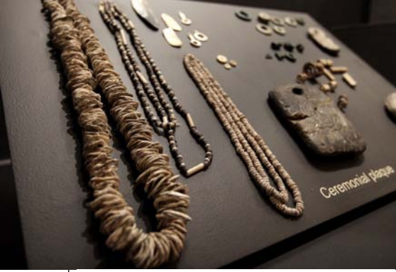
Above: Tongva artifacts, typical of those uncovered near the site of the sacred springs.

The site was said to have yielded paints, grinding stones, bone tools and several other artifacts.”